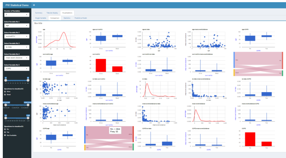
Figure 2. Mass visualization of 5 variable and their combinations( 3 numerical and 2 categorical). Red colored charts represent the diagonal (a single-variable chart).