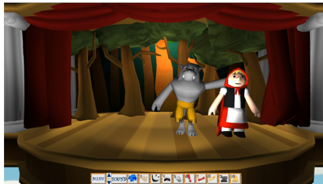
Fig. 1. Stage application at work; lower menu presents stage director options; both puppets are controlled by players.

Puppettime is a digital puppetry project that uses multiple mobile phones as objects to control puppet performances on a projected 3D virtual stage. It is multi-player, allowing different players to join at any time and participate locally in a shared performance. Once the players have logged on to the central virtual stage, each one can customize their puppets on the mobile devices before they launch them into the performance. During such a performance, each player can either control their puppet with a single device – much like a simple rod puppet – or with two devices that allow for more detailed animation control of body and a puppet limbs.