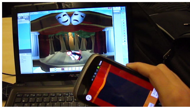
Fig. 3. Single phone control scheme; movements are directly projected onto the puppet body.

The dual phone control adds a second phone that controls either the arms or the head in addition to the main body. The secondary phone provides an interface to allow the user to select which additional limb to control: head, any single arm, or both arms (fig. 2 left). Rotations of this second phone will rotate whichever limb is selected. The access in this case is more complex, since the limbs are restricted to only rotate around a fixed joint, and the arms and head cannot match the orientation of the phone directly because they remain attached to the virtual avatar's main body.