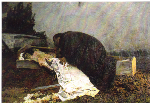
Fig. 1. Hatred by Pietro Pajetta, oil on canvas

Style. The style combines realistic methods with abstracted approaches to underline the topic and to lead the audience's eye to focus on the center of the painting. Even though at first, the painting looks realistically painted, it isn't: The painter carefully focused on the character of the dead woman and added lots of detail to her clothes, especially her white skirt, to make it the most outstanding part of the painting. The second character is almost a mere silhouette, with lack of details. It hovers like an ambiguous shadow over the first character and is nearly as stylized as the nature in the background, which is just implied by its shapes (the trees and the horizon). The level of detail increases with the immediate proximity, while the shapes in the distance appear blurry.