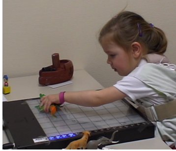
Fig. 2. A young girl playing the animal game.