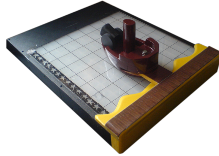
Fig. 3. The final version of the tangibles used for the boat shooting game.

palm and then hit the lighted square in time. On hitting the square, one of ten ‘funny’ sounds is played and a point is awarded. If the wrist is raised while hitting, this is indicated by playing a spoken text. Once 16 points are achieved the game is won and the border of the board flashes green for several seconds.