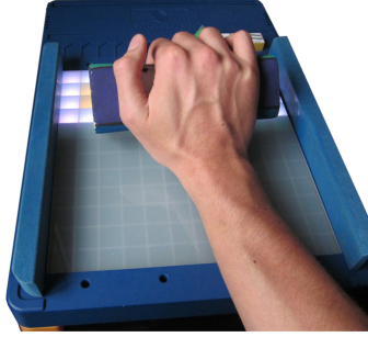
Fig. 4. Hearing the answers in the “Ik hou van Holland” game: tumbling a block, targets a passive form of rotating the hand backwards.