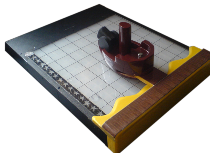
Fig. 3. The final version of the tangibles used for the boat shooting game.

palm and then hit the lighted square in time. On hitting the square, one of ten ‘funny’ sounds is played and a point is awarded. If the wrist is raised while hitting, this is indicated by playing a spoken text. Once 16 points are achieved the game is won and the border of the board flashes green for several seconds.