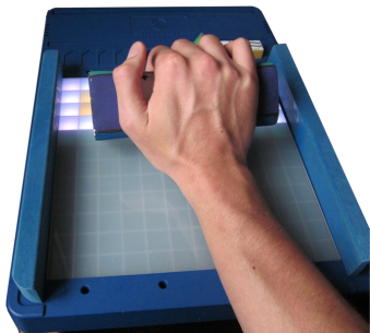
Fig. 4. Hearing the answers in the “Ik hou van Holland” game: tumbling a block, targets a passive form of rotating the hand backwards.