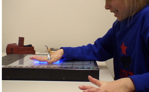
Fig. 1. A nine year old girl laughing while playing the hitting game.