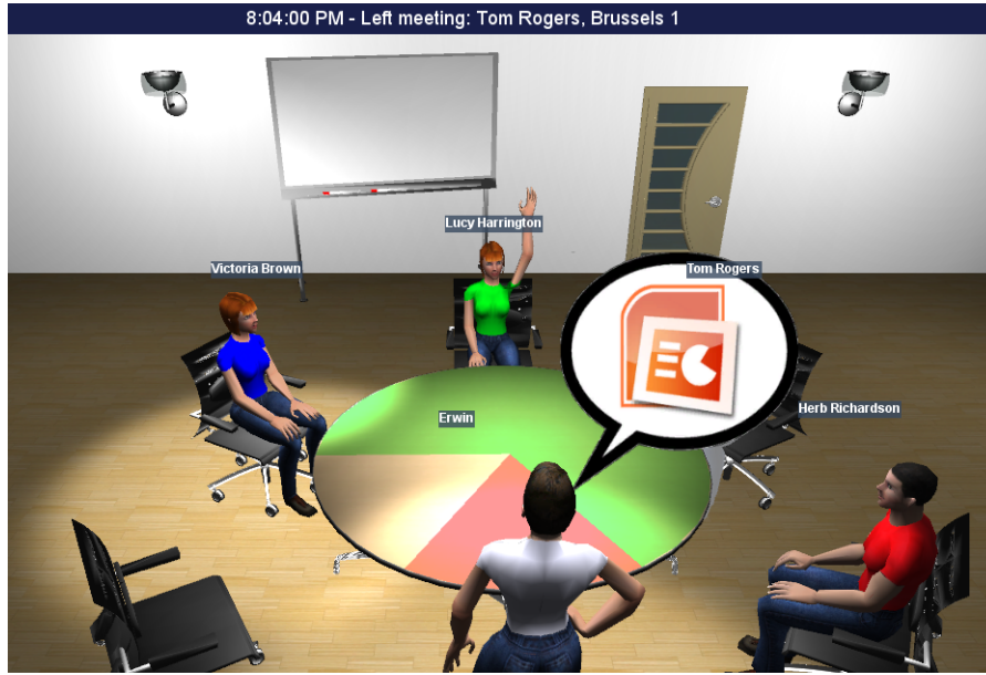
Fig. 1. The VMR application showing participant Erwin as presenting using a speech bubble with powerpoint logo; participant Victoria as speaking using a spotlight; participant Lucy with raised hand.

(e.g., is s/he paying attention). As a form of metadata about the physical world, detailed information of each participant (e.g., name, company, meeting role, etc.) is also shown in the VE.