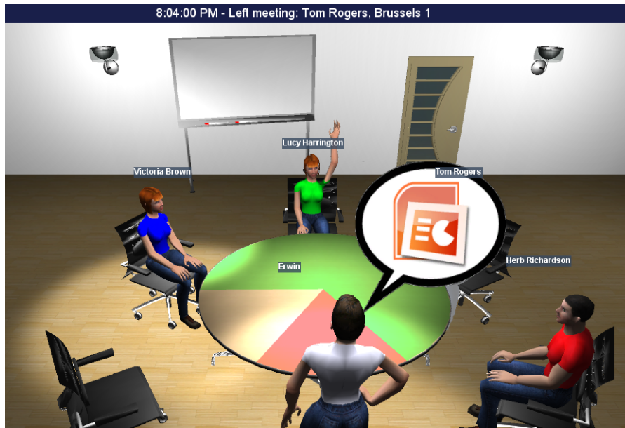
Fig. 1. The VMR application showing participant Erwin as presenting using a speech bubble with powerpoint logo; participant Victoria as speaking using a spotlight; participant Lucy with raised hand.

(e.g., is s/he paying attention). As a form of metadata about the physical world, detailed information of each participant (e.g., name, company, meeting role, etc.) is also shown in the VE.