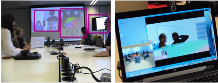
Fig. 3. Left: Setup during group interviews with three screens: video stream, VMR and presentation slides. Right: Setup during expert reviews: the VMR, the video stream from remote locations and a feedback image of themselves.