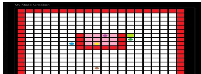
Fig. 3: A snapshot of the 2-D game grid with some of the components defined.

While a trap reduces the value of a character attribute, a buff increases the value of a chosen attribute by an amount set by the game author. Finally, a treasure increases the value of a treasure item that is defined by the author. For each treasure item the author defines a specific amount for its successful collection. Successfully collecting all treasure items provides a winning terminating condition for a player in the game.