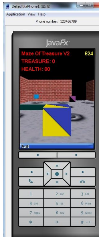
Fig. 4: Snapshot of the rendering client depicting the player (the blue & yellow cube) close to a trap (the green floor) facing an enemy (the black & purple cube) and a health item (the blue cube).

with the development of abstract models for other classes of games (e.g., sports, business or social games) and the provision of multiplayer capabilities in the rendering client.