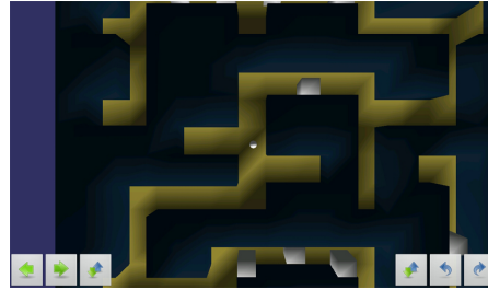
Fig. 4. Traditional touch button controls

The third concept is based on the known techniques by placing visible buttons on the screen to allow interaction (fig. 4). The number of buttons for this concept is 6: Two buttons to rotate, two to translate and two to switch the view. The buttons for switching the view are toggle buttons. The translation and view switching can be done in all views while the rotation is only possible in the top view.