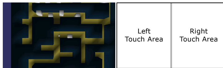
Fig. 2. Touch areas with accelerometer support

The first concept provides no visible objects on the touch screen (fig. 2). It is divided vertically in two areas. Pushing the left side will trigger an action to the left and similar behavior is triggered on the right side. In the top view rotation is done by pushing the areas while in the third person view pushing leads to translations to move around obstacles. The switching between the two views is done by pitching the device. Holding it horizontally brings up the top view while holding it obliquely will switch to the third person view. The result is a clean screen and an intuitive way to switch the views.