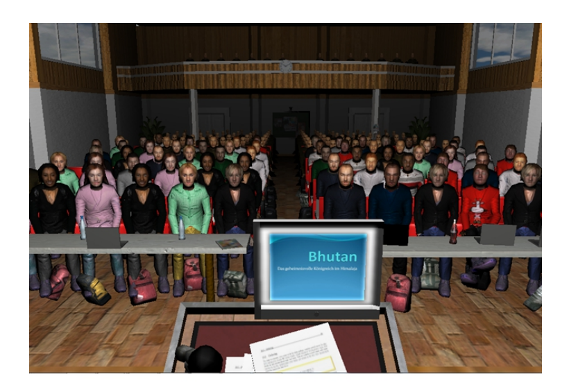
Fig. 1. 70 avatars with fill sprites.

3 dimensional virtual avatars are placed in rows of red seats, with a table in front of each row. The last rows and the tribune are, when adjusted, filled up with 2 dimensional sprites, which is not noticeable at this distance and increases the performance of the application. As an example, Figure 1 shows the room with 70 people and fill sprites in the back.