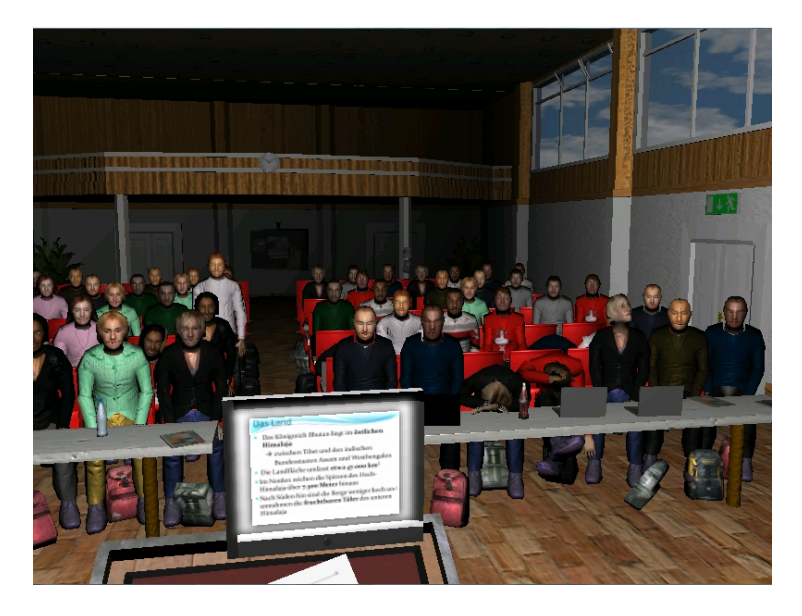
Fig. 2. A person asking the participant to speak louder. Some listeners are sleeping.