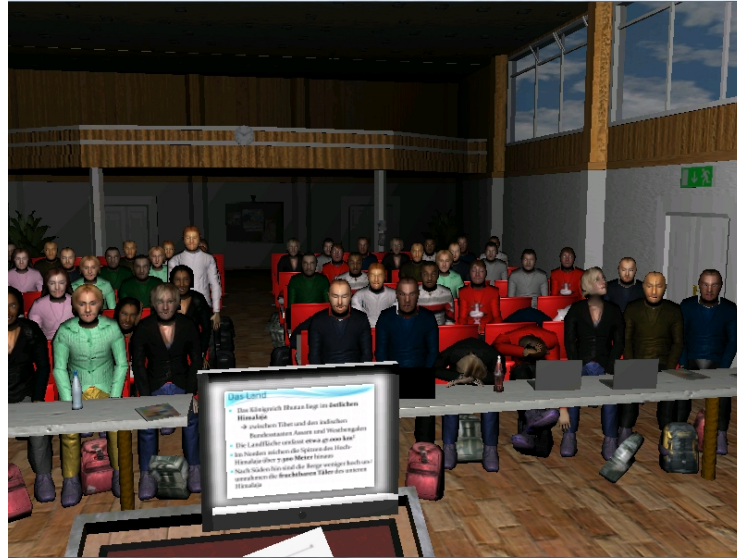
Fig. 2. A person asking the participant to speak louder. Some listeners are sleeping.