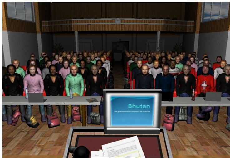
Fig. 1. 70 avatars with fill sprites.

3 dimensional virtual avatars are placed in rows of red seats, with a table in front of each row. The last rows and the tribune are, when adjusted, filled up with 2 dimensional sprites, which is not noticeable at this distance and increases the performance of the application. As an example, Figure 1 shows the room with 70 people and fill sprites in the back.