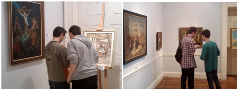
Fig. 3. Students of the mobile-based game were immersed in questions displayed on their mobile phones

The results highlight that the enrolment with the mobile affects their performance. However, both (paper-mobile) games persuade the children in several ways. A team benefits from a strategy and game characteristics seem to motivate and excite them for the activity. In addition, based on the observations of the researcher students seemed to be more focused and immersed on the mobile application (fig. 3). Interestingly, mobile application did not push students to lose their interest for the museum as many paintings and its features are discussed from students by the end of the experiment and on the respective course on school. Another notable observation is that students from both groups spent approximately the same total time at the gallery (19 min on average). This may be derived from students' familiarity with mobile phones and the simple design of the game.