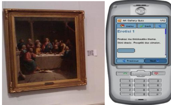
Fig. 2. The QR codes were placed next to the paintings (left), the mobile application (right)