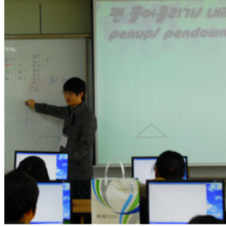
Fig. 2. Students's class working.