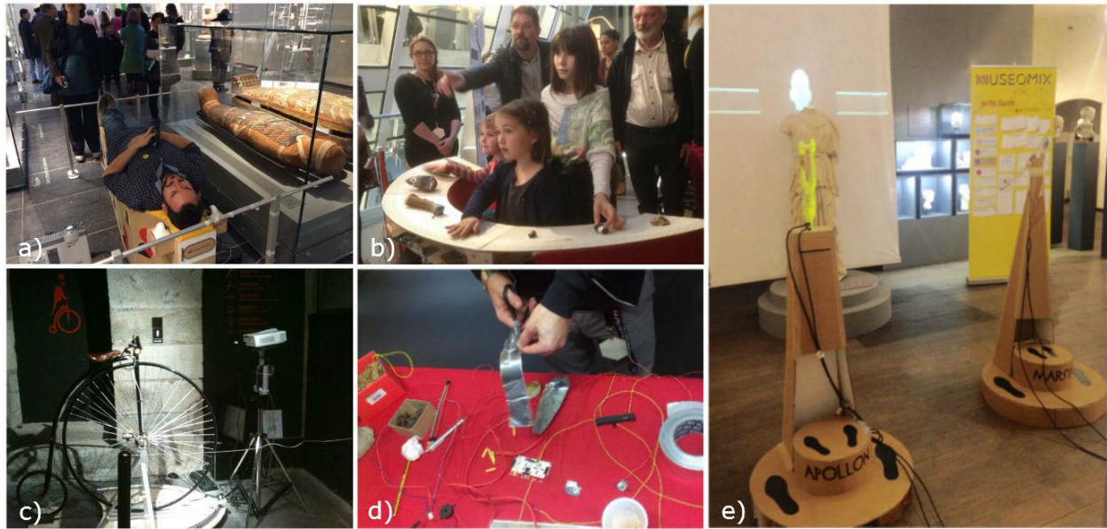
Figure 2: Museomix prototypes a) Momix b) Prehistopiano c) Museocyclette d) Making-off Prehistopiano e) Hero des Lyres