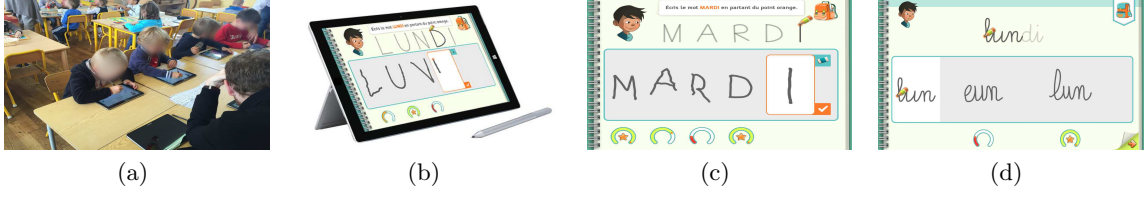
Fig. 1. IntuiScript project overview: First in-class experiment (a), with example of tablet tactile device used (b), and different modules: for Block Letter Writing (c), and for Cursive Writing (d)