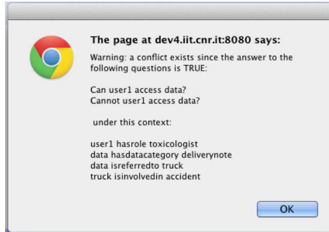
Fig. 5. Detection of conflict between an authorization and a prohibition

Conflicts may also raise between obligations and prohibitions. Indeed, it is possible that some actions are prohibited by an organization and obliged by another one. This is the case of obligation O_{R1} by Red Cross and prohibition P_{F1} by Fire brigade. The Fire Brigade does not permit to communicate the alert state to people not belonging to the rescue team while Red Cross members are obliged to communicate the alert state, e.g. , to people living in the area surrounding the accident. The conflict detection raises with the following contextual conditions set to true: