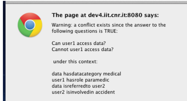
Fig. 4. Detection of conflict between an authorization and a prohibition

These conditions allow the paramedic to access the medical data (according to authorization A_{R2} ). On the other hand, the individual is not in peril of her life. This is due to the fact that the context user2 hascondition critical is not true. The lack of this context activates prohibition P_{V1} according to which the paramedic is not allowed to access the data. The conflict detection is shown in Figure 4.