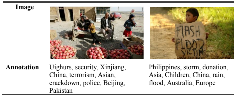
Table 4. Extracted annotation using proposed method

So, we are able to compare t_i and k_j and determine how much they are closed to. Eventually, we can obtain final annotation for given image through proposed process. The following Table 4 the news images and its annotation grasped automatically. The annotations are different from other traditional research that described object in given images. Recognizing an object in images is not cover major meaning of images. The proposed approach in this paper focused on the annotations which describe core meaning of given image. Hence, annotated words are semantically related to titles and images. We believe that this annotation can represent not only documents but also images. However, traditional approaches only can detect object in image so, results will be ‘human,’ ‘apple,’ ‘boy,’ ‘girl,’ and so on for first image in Table 4.