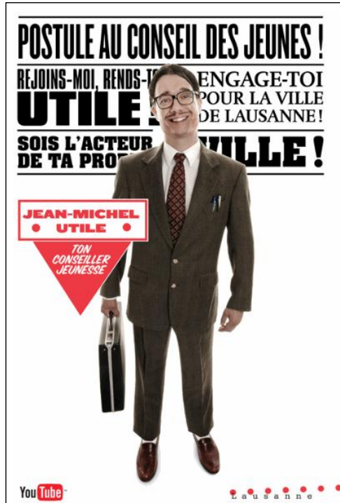
Fig. 1. The John-Michael Useful billboard ad, asking the youth to apply for the Youth Council.

A Facebook profile was also created for John-Michael Useful, where he would post regularly and gather about 500 friends during the campaign. What is worth mentioning is that City of Lausanne blocks the use of Facebook by its employees, and that they had to ask for an exception to the Municipal Council (i.e. the executive branch of the local government). A dedicated machine with a separate Internet access had to be set up. This is not only an anecdote, but it shows how far certain public administrations can be from using social media for their official communication and for opening a dialogue with the people.