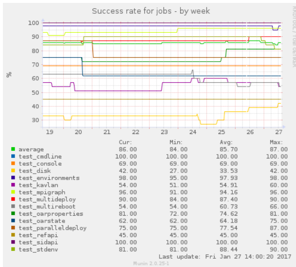
Figure 3. Historical status for each job, as provided by Munin