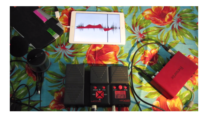
Figure 1: The Voice Reaping Machine.

Despite this relevance, designing for playfulness remains a challenging task, as little knowledge is available for designers to support their choices. For example: in case we want to design a playful NIME, how should we proceed? How can we make sure we are properly addressing playfulness in our design? In other words, what kind of design decisions should one make so that the resulting NIME is playful?