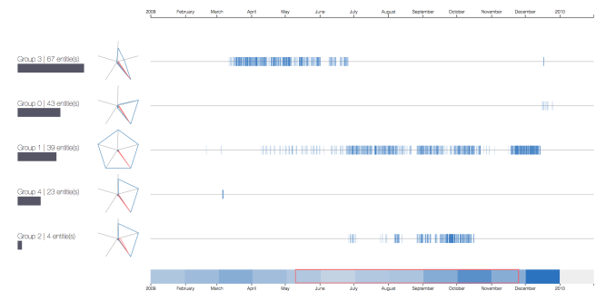
Figure 2: Timeline view showing transactions grouped by entity clusters over time as well as attributes of each entity cluster.