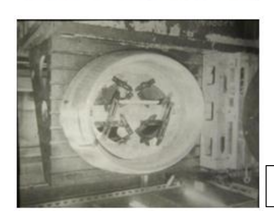
5: The parabolic cut has been repeated with a smaller cutter.