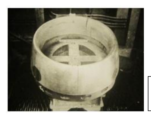
6: The final smoothing cut has been completed and the part is ready for use in forming the inlet sheets.