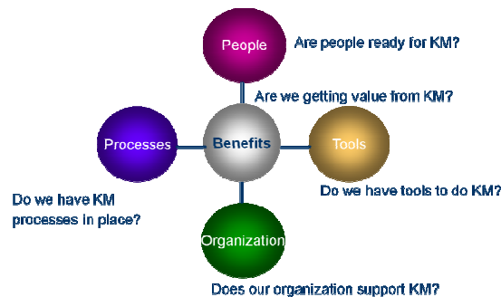
Fig. 1. BTOPP Framework of Scott-Morton adapted for knowledge management system by Dalkir, 2011