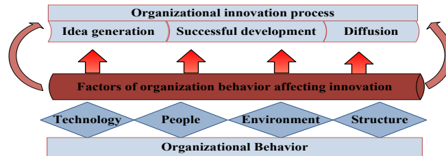
Fig.2. organizational behavior in supporting innovation

be commercialized. The innovation is diffused internally and/or externally for wider use of customers in order for the organization to be able to gain the benefits and reap the profit.