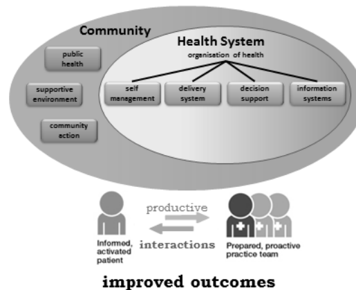
Fig. 2. Expanded Chronic Care Model: adopted from Barr et al. [2].

fectively take care of themselves. Note: health system and community are dealt with in two separate sections below, where the section on “health system” explores the notions of information systems, decision support, delivery system and self-management. The text on the health system is treated purely as background and is not explored in detail.