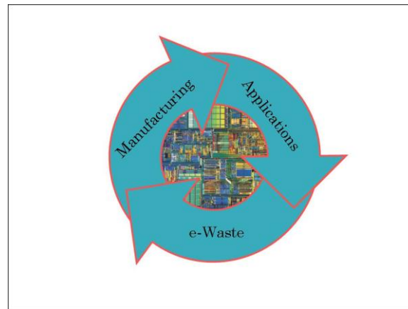
Fig. 2. The ICT life cycle.

Even more impressive is that the number of Internet users reached 2.26 Billion on December 2011 with more than one billion concentrated in Asia [6]. Also, in 2011, the number of networked devices has equalled the world population (7 Billion) and it is estimated to reach more than 14 Billion in 2015 [4].