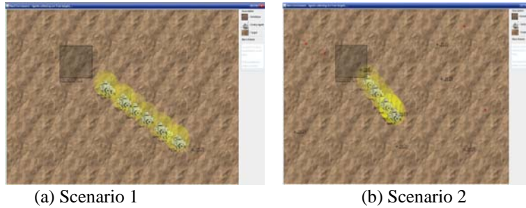
Fig. 3. Running snapshot of the Case

We have implemented the BDIP robots in a simulation way by using the Jadex platform [10]. The basic actions of agents are implemented as Plan of the agent. Some important information such as ore resource positions are implemented as Belief , the interaction among agents this case is implemented as the message events of the agent. The Intention of the robots are to find the ore resource and carry ore back to base. On the other hand, the policy conditions are implanted as either a part of belief (e.g. ore resource) or implemented as the message events. When the system is running, if the policy conditions are satisfied, the agent will perform its behaviors comply with these policies, the trigger condition of the plans are implemented same as the policy conditions .