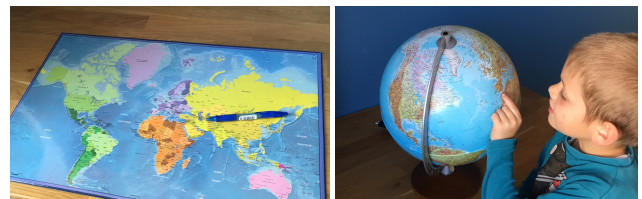
Figure 2. Traditional representations of geographical data: a planar world map desk pad, and the spherical globe.