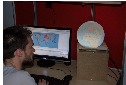
Figure 1. (left) Prototyping a GUI application with a 3D preview on the desktop, and (right) deployment on an interactive spherical display.