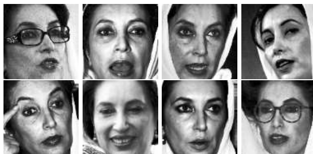
Fig. 4. Examples of one face from the ČTK face corpus

Figure 4 shows one example from this corpus. This corpus is available for free for the research purpose upon request to the authors.