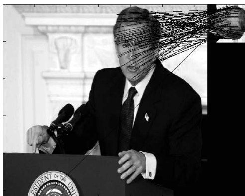
Fig. 2. Matched key-points in two different views of the same object (face)

Figure 2 shows how two images of the same object (a face) with varying scale and orientation are matched.