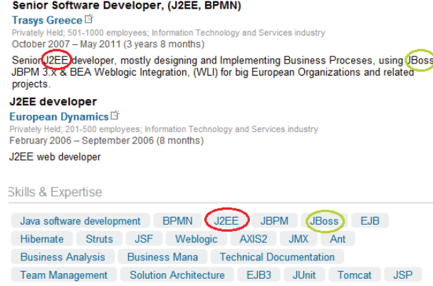
Fig. 3. LinkedIn skills example.

the work experience section (title or description text) of the respective LinkedIn profile. Also, let S be the skills required by the current job position, corresponding to the job position domain and may be found at any level of the hierarchy. If there is an overlap between S and S_1 ( S \cap S_1 \neq \emptyset ), the past job position E_1 is regarded as relevant and thus is taken into account in the relevant job experience calculations.