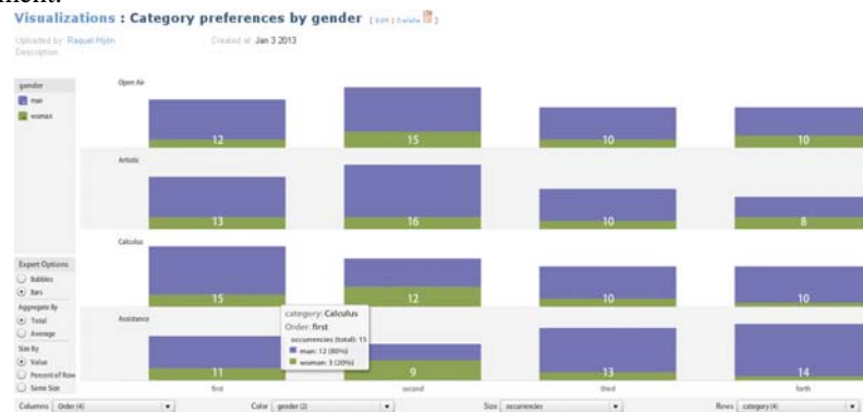
Fig. 4. Scatterplot of Categories chosen by genders

Figure 4 shows students preferences selected on the Kuder-C test [16, 17] of vocational preferences taken by students for their categorization at the beginning of the experiment.