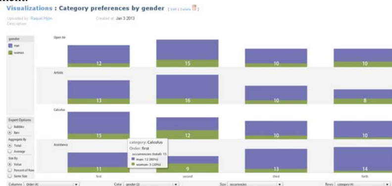
Fig. 4. Scatterplot of Categories chosen by genders

Figure 4 shows students preferences selected on the Kuder-C test [16, 17] of vocational preferences taken by students for their categorization at the beginning of the experiment.