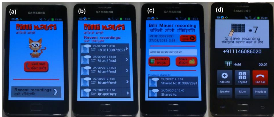
Figure 3: Screenshots of the Billi Mausi Android application: a) home screen, b) list of recordings, c) single recording selected, d) screen during the phone call.

We chose Android as the platform on which to design the smartphone application. The application uses the same voice-based service that was also used in the feature phone study; it calls the same phone number and receives the same SMS. However, the visual interface augments the phone call and intercepts any incoming SMS based on a regular expression. The final interface with which the user tests were carried out can be seen in Figure 3.