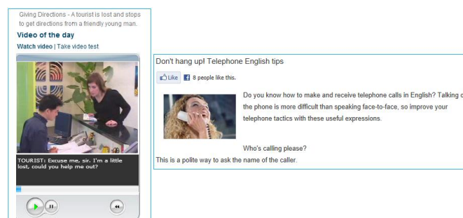
Fig. 4. (a) Video to learn Directions in English and (b) Article to learn Social Protocols .

Next, the researcher analyzed the degree of cultural approximation promoted by selected interactive resources. We saw that the articles were being used to contrast two cultures with examples and explanations (guided tour visitor metaphor); videos typically sought to immerse students in the foreign culture (foreigner without translator metaphor); and quizzes and lessons led students directly into the foreign culture's context, providing them with linguistic support (foreigner with translator metaphor).