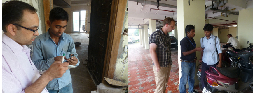
Figure 2 : Researchers demonstrating the visual conversational interface to subjects from target population.