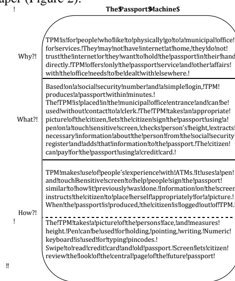
Figure 2 Creation of techsona through answering the questions of the Human-Artifact Model (The Passport Machine as read about in the newspaper)

The students used The Human-Artifact Model as an interface between personas and techsonas, to analyze potential matches and mismatches between human beings and a technology as it was described, or tensions between persona and techsona. The Human-Artifact Model was also used to structure the development of a techsona, e.g. when the students were asked to develop a techsona based on the passport machine described in a newspaper (Figure 2).