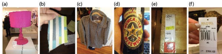
Fig.3. Examples of shopping photos

Physical Products: Taking a photo of the actual product was most common, with 54% of photos showing the full product (Figure 3a), and an additional 12% showing a partial product (Figure 3b) - often a close-up focusing on a specific aspect of the product, such as the texture of a scarf. Furthermore, taking a photo of a product already owned accounted for 16% of photos. (Figure 3c)