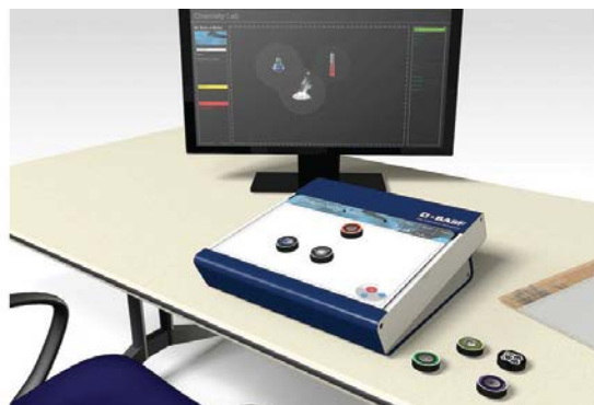
Fig.12. VCLT GUI , Fig 13. Desktop console concept render