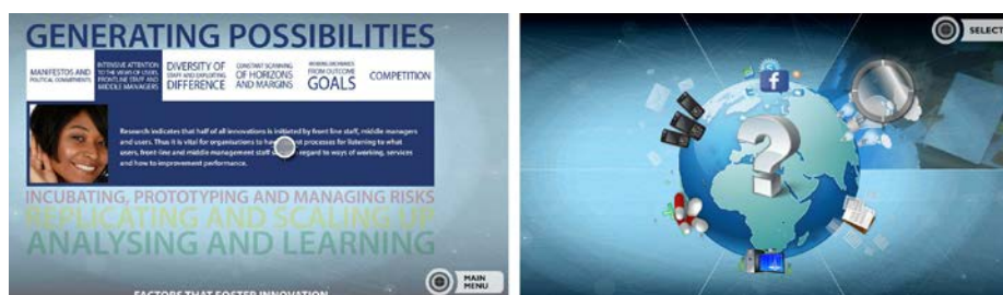
Fig. 7. iPoint “Don’t click” GUI, Fig 8. Sample of final GUI solution

Our first iPoint GUI ( Fig. 7 ) was a structure of unfolding and collapsing content display areas which open and close according to the position of the cursor. However, what seemed a viable solutions for a Desktop computer interface with a mouse pointer, did not work as a finger-pointing device. After selecting content, users had to leave their arm in the same position as long they needed to absorb the content, which caused great discomfort for our users. A subsequent version was designed in a way that users could lower their arm without triggering other content areas. But even this solution resulted in many accidental selections. The current design comprises of a time-delayed activation, a visual countdown, which activates a link only if a user remains in one position for a few seconds. A similar solution is featured in Microsoft Kinect games.