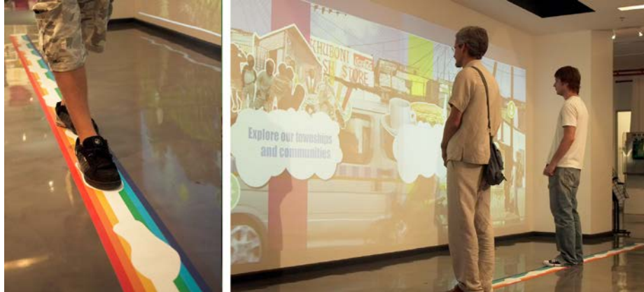
Fig. 3,4. Interactive wall for Cape Town Tourism Visitor Centre

Limitations of the interaction. At the time we used infrared cameras for blob detection not only for multitouch displays, but also for interactive floor and wall projections (Microsoft Kinect had not been released yet). The overhead 2D-tracking of user activity on the floor only provided x and y positions as well as blob size and grouping as a means of user input. Since the floor in front of the wall is also a passage area in the centre we had to differentiate between intended and accidental users. In order to avoid accidental inputs, we decided to limit the interaction area to a designated floor strip in front of the wall and only worked with object movement on the x-axis, which further limited the user control in the application. We used a vertical colour bar which moved with the user across the wall to make the user aware they are influencing the environment. Next, we decided to trigger content when a user stopped at a certain area as this may suggest an interest in the special area.