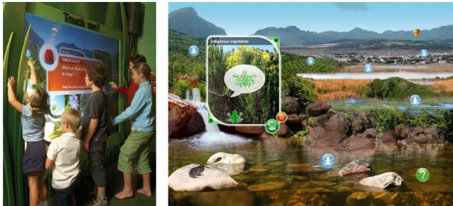
Fig. 1. Frog multitouch wall, Fig 2. Frog wall GUI

The frog wall sported various novel features which had not been seen in South Africa at the time and thus presented itself as a good case study for nontraditional HCI as it was exposed to some thousand users from various cultural backgrounds every day at the Two Oceans Aquarium.