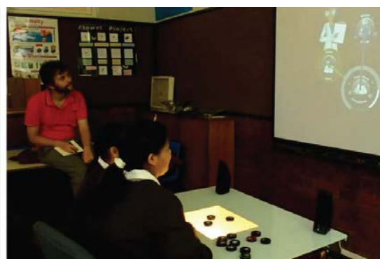
Fig.14. VCLT CMS, Fig 15. User testing at Wynberg Girl's Junior School