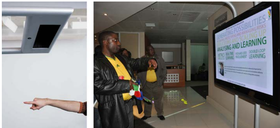
Fig. 5. iPoint tracker by HHI Fraunhofer, Fig 6. Problems with the gesture application

As part of a larger installation of various interactive displays for the Centre for Public Service Innovation (CPSI) near Pretoria, we created several user interfaces for a hand and finger-tracking device developed by HHI Fraunhofer in Berlin ( Fig 5 ). iPoint accurately tracks one or multiple finger gestures, which can then be calibrated to navigate a Graphical User Interface. We developed two applications for this system for an educational exhibition environment, one information kiosk with best practise examples of innovation in public service, one assessment of the users’ understanding of innovation principles.