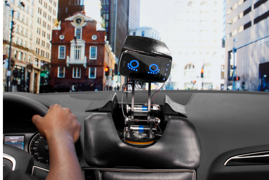
Fig. 1. In-car concept of the Affective Intelligent Driving Agent (AIDA).

AIDA allows users to accomplish their driving tasks while promoting in-car safety by keeping the phone out of the driver's hands. Since AIDA acts as an intermediary between the driver, the phone's applications, the vehicle and the environment, people will not lose access to the applications they need to perform their activities. Further, as opposed to traditional methods of driver-vehicle communication, e.g. flashing icons and chiming sounds, AIDA communicates with the driver through speech, coupled with expressive body movements.