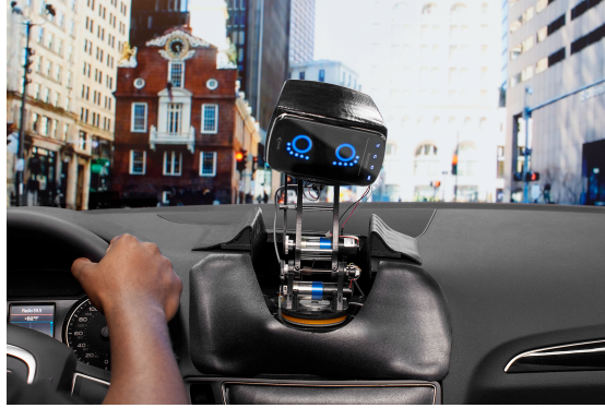
Fig. 1. In-car concept of the Affective Intelligent Driving Agent (AIDA).

AIDA allows users to accomplish their driving tasks while promoting in-car safety by keeping the phone out of the driver's hands. Since AIDA acts as an intermediary between the driver, the phone's applications, the vehicle and the environment, people will not lose access to the applications they need to perform their activities. Further, as opposed to traditional methods of driver-vehicle communication, e.g. flashing icons and chiming sounds, AIDA communicates with the driver through speech, coupled with expressive body movements.