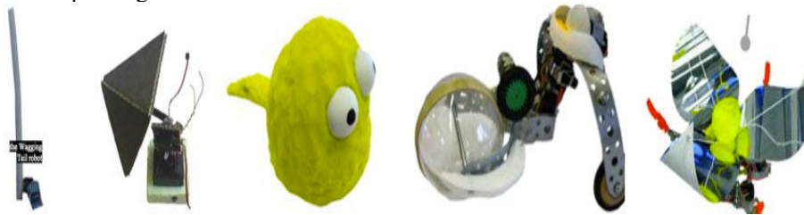
Fig. 1. Sub prototypes (from L-R): The wagging tail, the triangular robot, mr googly, walter cannon and raffelsia

Sub-prototype 5. Raffelsia. In order to explore techniques to portray the environment, we created the Raffelsia (flower like) robot. It consisted of an in-house built water sensor and an ultraviolet light sensor. The “petals” of the robot would open and shut depending on water intake and if it was outdoors or not.