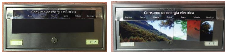
Fig. 3. Mailbox of one participant in the beginning (left) and in the end of the study (right)

In the other two families (from a different block), the task was performed by the father, (House 3) and the mother (House 4). The positioning of the mailboxes meant that it was almost impossible for neighbors to ignore each other’s consumption. This was confirmed during the interviews, 2 of them were actually curious to check: “I got surprised in the end, our values were close (comparing with the neighbor), but of course since we are comparing savings the actual consumption values could be different)” House 3 Father.