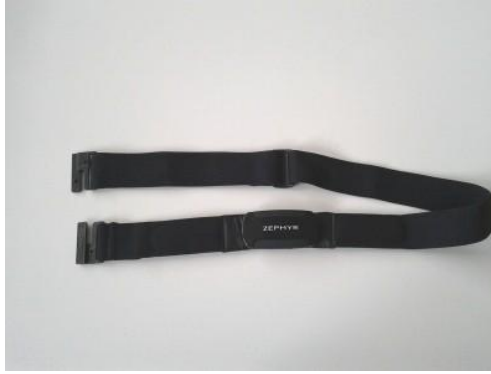
Figure 2: Zephyr HxM heart rate monitor

heart rate, the points will double. To lower the heart rate for the relaxing mode, the gamer can take slow deep breaths or sit/lay down.