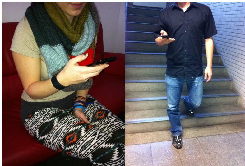
Figure 4: Participant during relax mode (left) and during challenge mode (right)

Questioned if they would integrate or use their environment in a mobile game, e.g. running up stairs, the mean rating was 4.07 on a five-point-scale (1=would not integrate/use it, 5= would integrate/use it).