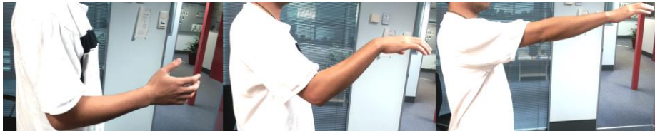
Fig. 2. From left to right: shoulder at rest, partially extended forearm, fully extended arm

On average, the glove interface was reported to be the most fatiguing by participants ( \mu = 4 , \sigma = 1.9 ), followed by the wand ( \mu = 2.4 , \sigma = 2.2 ) with the mouse being the least stressful to use ( \mu = 1.3 , \sigma = 2.5 ).