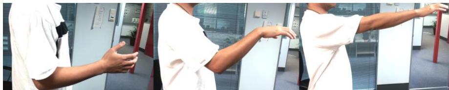
Fig. 2. From left to right: shoulder at rest, partially extended forearm, fully extended arm

On average, the glove interface was reported to be the most fatiguing by participants ( \mu = 4 , \sigma = 1.9 ), followed by the wand ( \mu = 2.4 , \sigma = 2.2 ) with the mouse being the least stressful to use ( \mu = 1.3 , \sigma = 2.5 ).