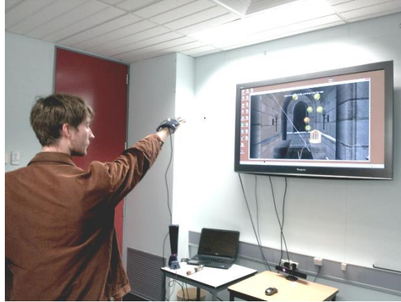
Fig. 1. Selecting a firefly in the select-drag-drop trial using the P5 Wired Glove

The trials presented the tasks consecutively with a brief break between each task explaining what needed to be done before it was begun. At the end of each sequence of tasks, the participant was given a 5-10 minute break to rest their arm before continuing with the next interface device.