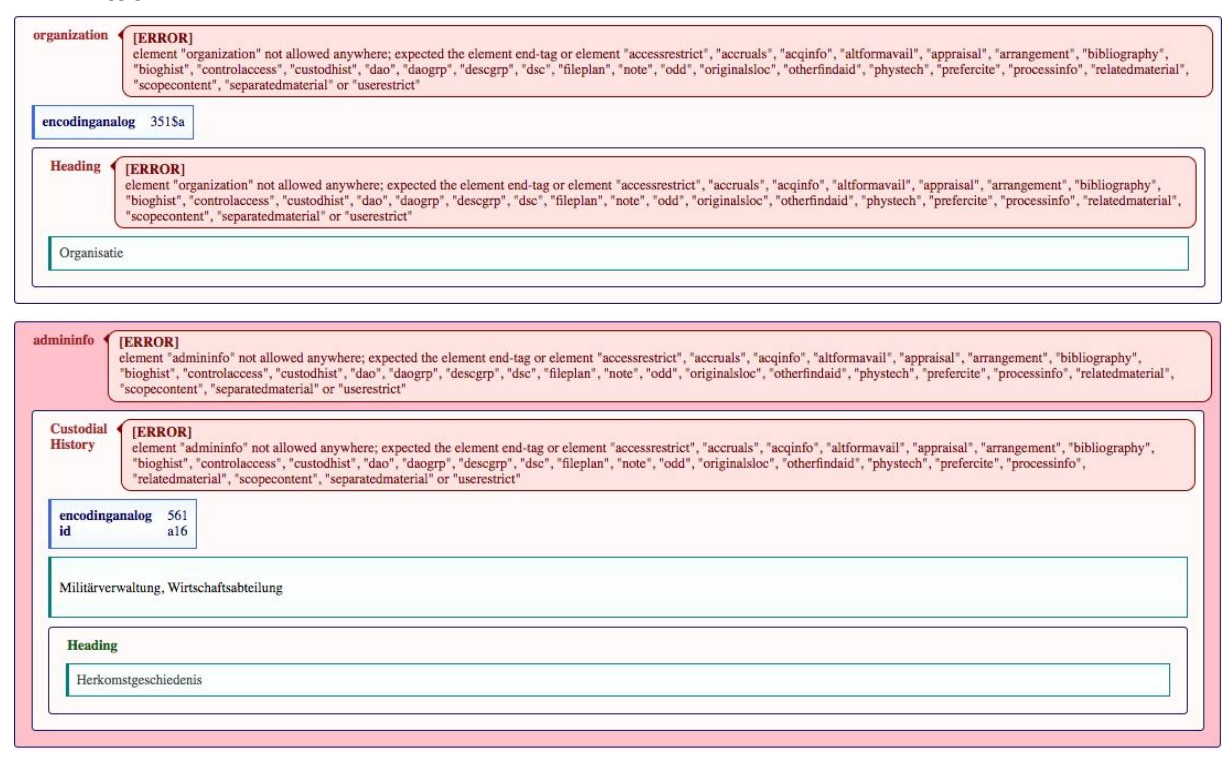
EAD validation errors in the Conversion tool.

The two screenshots above shows how the error message are rendered in the conversion tool.