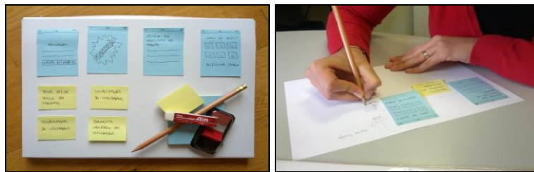
Fig. 1. Application representation made by one of the participatory design users.

DETACH's development process was heavily rooted in participatory design [1][13] and thinking aloud sessions not only with therapists but clinicians in general ( Fig. 1 ). We have conducted a substantial set of meetings to understand: a) their current requirements and expectations for a tool of this nature; b) how modern smart-phones can improve existing therapeutic practices without disrupting established procedures; c) interaction patterns employed by our stakeholders when organizing different elements of an application.