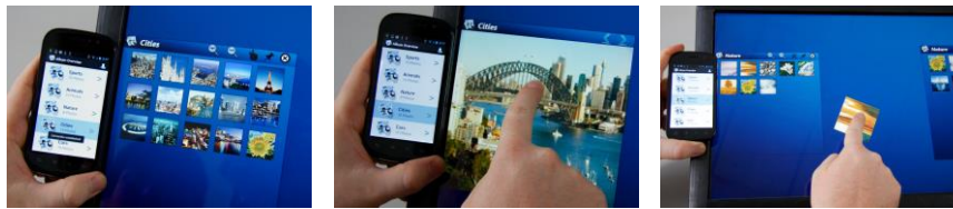
Fig. 4. The photo sharing application: (left) extended overview; (middle) focus on a single image; (right) sharing images with another user by dragging an image from one extended interface to another.

For the experiment, we implemented based on Schneider et al. [14] three applications that allow users to experience the MOBIES concept. These include a photo album , a map , and a web browser application. All applications could be used with an additional external display or as a stand-alone mobile application using only a mobile phone. Using only the mobile phone without the extension of the user interface on an external display was used as a comparative condition for the practical tasks (in the following referred to as the mobile-only or MO option). The features of the applications cover standard functionalities inspired by existing Android applications.