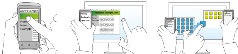
Fig. 2. (left) The mobile user interface allows for the display of a limited amount of information. (middle) Connecting the mobile and an external display extends the available screen space. (right) Items can be shared with others via drag-and-drop to another connected mobile device.

The concept of MobIES is based on users temporarily creating a physical and spatial connection between their mobile device and an external screen to create a larger logical display that consists of the mobile interface and an extended interface on the external screen. We assume that displays in the users' environments can temporarily be used (e.g., public displays, kiosk terminals, TV sets, interactive surfaces, and even screens in cars or airplane seats). User interfaces of mobile applications can display only a limited amount of information (Fig. 2 (left)). By connecting the phone with an external display more screen space is available, thereby allowing for the distribution of the user interface on two screens (Fig. 2 (middle)). Existing work that investigated connecting mobile phones and external screens did not consider the potential of using the mobile and the external screen simultaneously for displaying information. The event of connecting the phone with the display can be sensed, for instance, by using NFC tags that are placed around the external display which is a novel way to use NFC tags for device location detection.