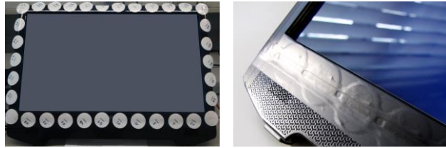
Fig. 3. Display border with NFC tags (left), covered with tape (right).

Our prototype of MobIES consists of two main components. First, a server application running on a PC connected to a host application that is displayed on the stationary touch screen (Dell ST2220T, 22" screen (1920×1080 px)). Second, a mobile client (for Android) running on the user's phone (Nexus S; 4" screen (800×480 px)). The server and the client manage the communication (via TCP over a wireless network) between the distributed application parts. Each application (e.g., a photo album) consists of a mobile component implemented as an Android application and a matching remote part implemented using the Microsoft Surface Toolkit. Depending on which application is active on the mobile phone when the phone touches the rim of the large display, the server launches a matching instance of the remote part of the application in the host application.