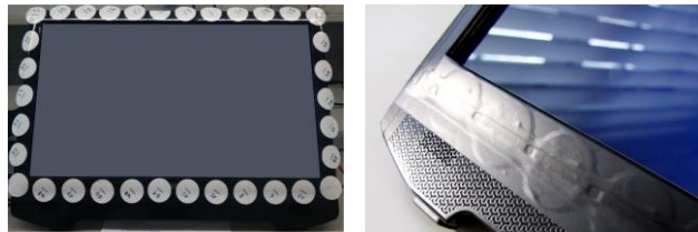
Fig. 3. Display border with NFC tags (left), covered with tape (right).

Our prototype of MobIES consists of two main components. First, a server application running on a PC connected to a host application that is displayed on the stationary touch screen (Dell ST2220T, 22" screen (1920×1080 px)). Second, a mobile client (for Android) running on the user's phone (Nexus S; 4" screen (800×480 px)). The server and the client manage the communication (via TCP over a wireless network) between the distributed application parts. Each application (e.g., a photo album) consists of a mobile component implemented as an Android application and a matching remote part implemented using the Microsoft Surface Toolkit. Depending on which application is active on the mobile phone when the phone touches the rim of the large display, the server launches a matching instance of the remote part of the application in the host application.