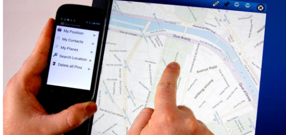
Fig. 1. Spanning a mobile user interface across the mobile phone and an external display, here showing a map application.

In this paper, we contribute MOBIES, a system that allows users to extend their mobile applications through temporarily spanning the user interface across multiple screens. In short, the technique requires users to touch the border of an available screen (e.g., a public display, TV, or desktop screen) with their phone during the interaction. The system detects this event and initiates the distribution of the user interface across the mobile and the external screen (see Fig. 1). Subsequently, users benefit from the extended screen space which facilitates tasks such as viewing a map, browsing the web, or showing and exchanging pictures to and with other users. When the phone is removed from the border of the external screen, the user interface returns to the original mobile mode. That is, users can take advantage of existing screens in their environments without the need to carry additional hardware.