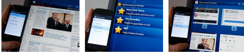
Fig. 5. The web browser application: (left) extended web page view; (middle) selecting bookmarks; (right) browser tab overview.

browser application: 1) Open the test webpage and look up the contact information of the author; 2) Add a test webpage to the bookmarks and check if the URL was added.