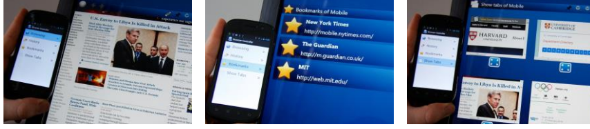
Fig. 5. The web browser application: (left) extended web page view; (middle) selecting book-marks; (right) browser tab overview.

browser application: 1) Open the test webpage and look up the contact information of the author; 2) Add a test webpage to the bookmarks and check if the URL was added.