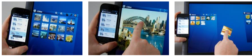
Fig. 4. The photo sharing application: (left) extended overview; (middle) focus on a single image; (right) sharing images with another user by dragging an image from one extended interface to another.

For the experiment, we implemented based on Schneider et al. [14] three applications that allow users to experience the MobIES concept. These include a photo album , a map , and a web browser application. All applications could be used with an additional external display or as a stand-alone mobile application using only a mobile phone. Using only the mobile phone without the extension of the user interface on an external display was used as a comparative condition for the practical tasks (in the following referred to as the mobile-only or MO option). The features of the applications cover standard functionalities inspired by existing Android applications.