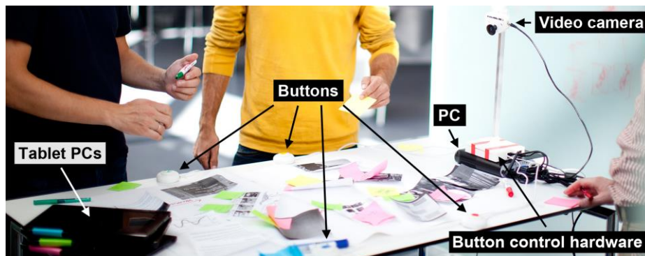
Fig. 2. The key components of the ReflecTable system

The ReflecTable extends this existing body of research by exploring how a novel system for video-led reflection on design practice might be combined with a gaming approach to reflection on design to address the particular challenge of bridging the gap between the theoretical and practical components of design education.