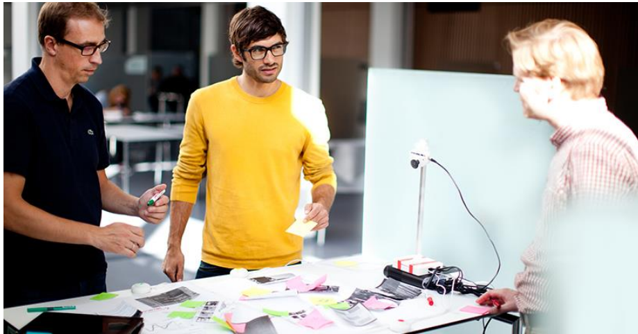
Fig. 1. The ReflecTable

design practice in order to develop these contextual and holistic understandings of what they are taught [31, p. 82]. However, the alternative, a focus on practical education through design projects, has also been found to fall short, in our own and others' experiences. While learning-by-doing allows students to develop personal experience of design practice, students are often given little opportunity or motive to reflect upon the relationship between the theories and techniques they are taught and the situations they encounter during their design projects [37].