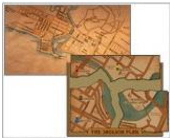
Fig. 2. Real artifact and game maps