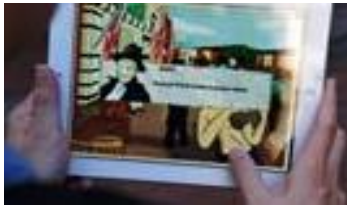
Fig. 1. Non-player character

Each dyad of participants was randomly assigned to one of the two conditions. In the experimental condition, students were taken to the Singapore River to complete their session (see Figure 3). A moderator was assigned to accompany each dyad of students. After briefly introducing the game, the moderator started the game and gave each dyad an iPad. The 18 dyads of participants in the control condition completed their session in a classroom in their school. After completing the game, each participant was asked to complete two paper-and-pencil questionnaires. Then, researchers bought each participant a meal, and asked them not to discuss the experiment with others.