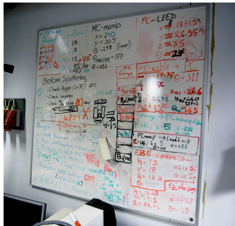
Figure 2 The whiteboard of interviewee 11 located at an experimental setup in a physics laboratory

interviewee 11 was extremely dense with information and we were told the overall structure of the information on the whiteboard hadn't changed for more than 6 years, while it was updated on a daily basis (Figure 2).