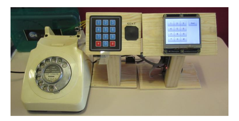
Fig. 2. The three telephone-style interfaces used by participants: the rotary dial (left), pushbutton keypad (middle) and touchscreen keypad (right).

-teen the three interfaces, as a visual display would not have been used on older interfaces.